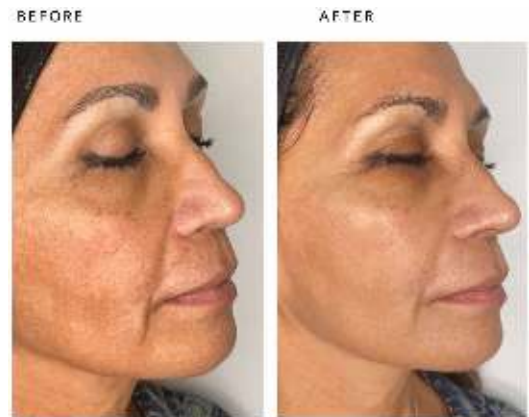
1 SALT FACIAL TREATMENT